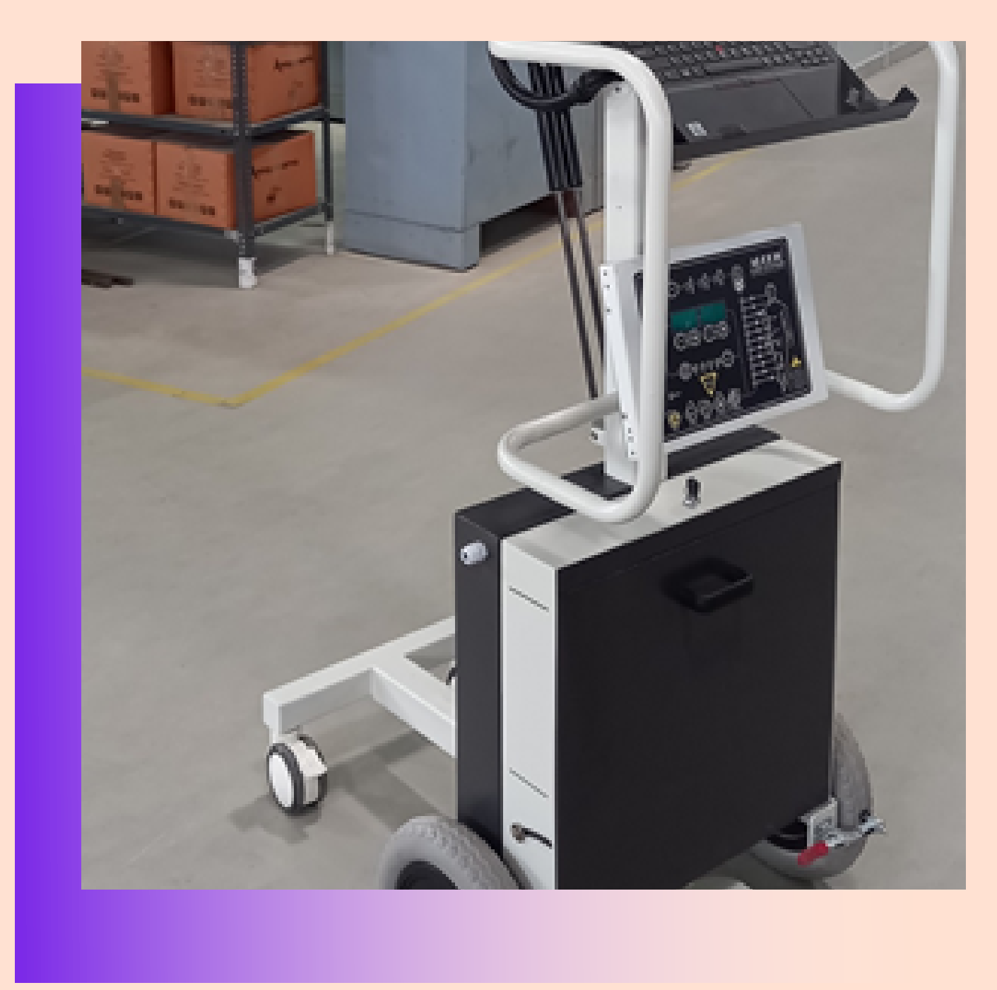
Portable Digital X-ray