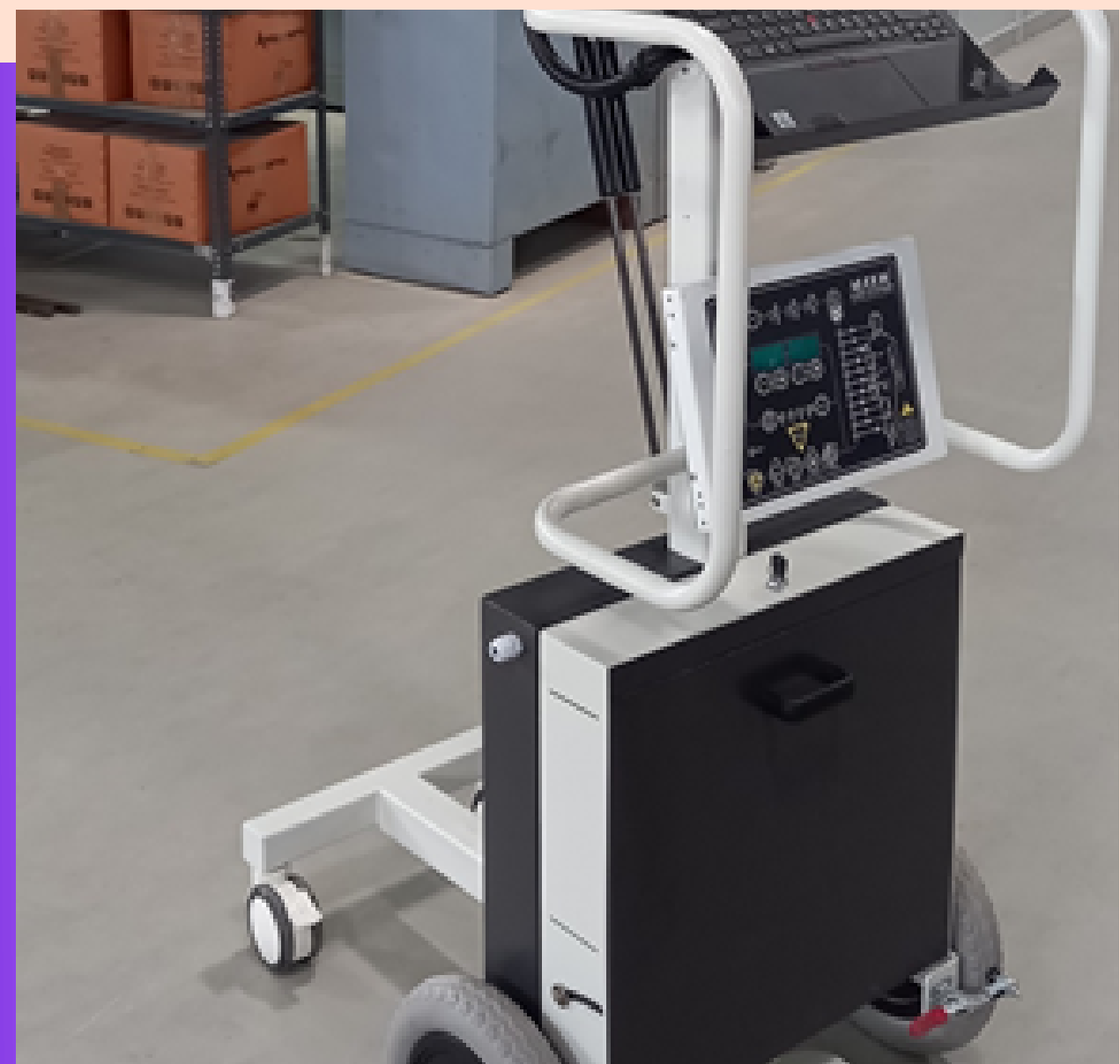
Portable Digital X-ray